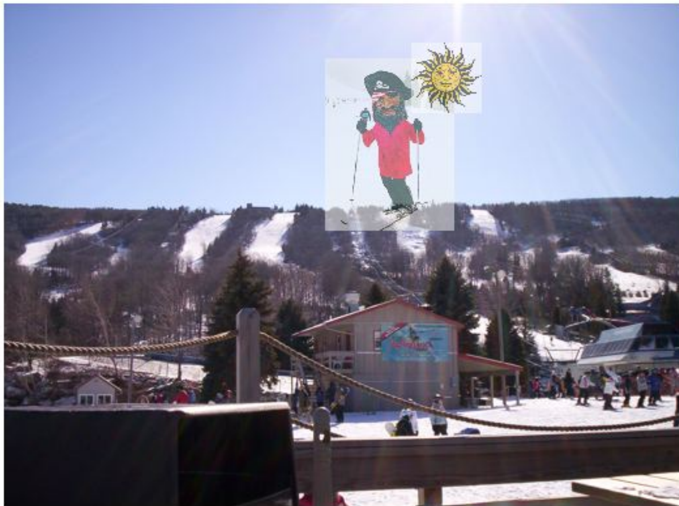
Captain Morgan put in an appearance on the slopes.