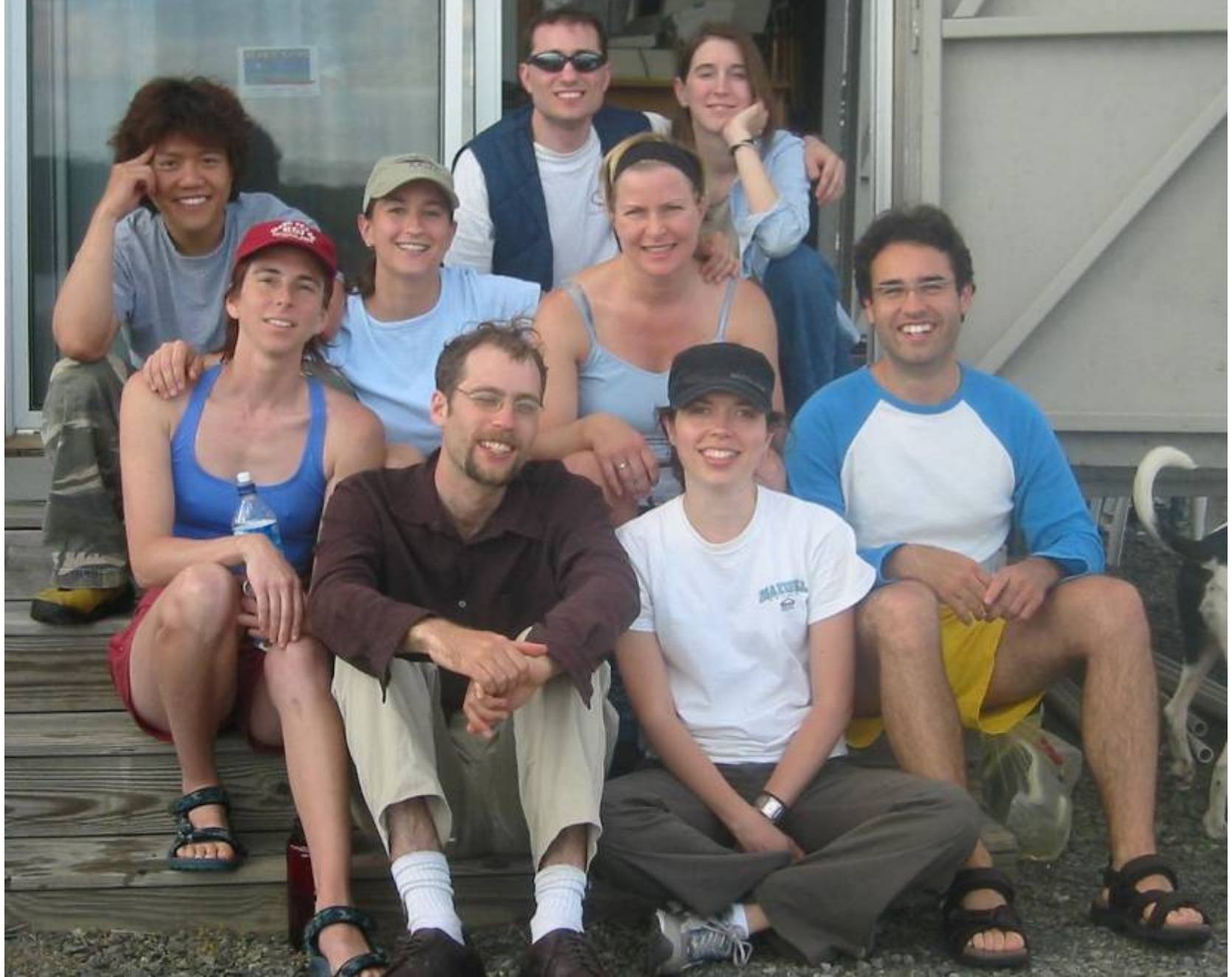
Out-paced, out-stroked, over-cooked. One big, happy, saturated, exhausted, a**-kicking group.